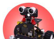
CODE WITH MICRO:BITS