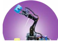
CODE WITH ARDUINO