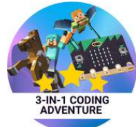
3-IN-1 CODING ADVENTURE