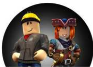
CODE WITH ROBLOX