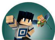
CODE WITH MINECRAFT

JOIN US FOR EXCITING NEW CAMPS THIS SCHOOL HOLIDAYS!